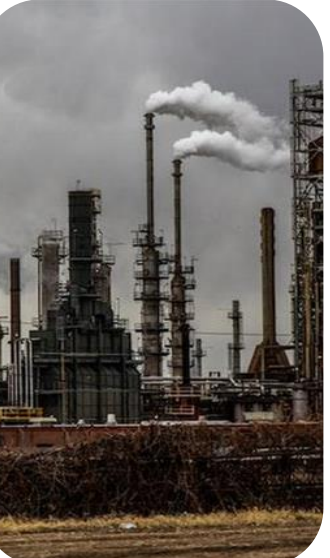
How might we leverage economic policies and incentives to mitigate and adapt to climate change