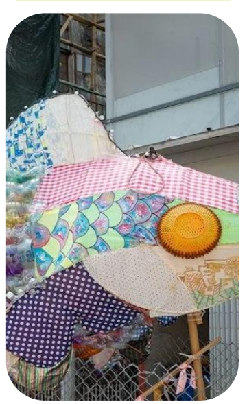
How might we generate less waste, or manage and dispose of waste in ways that consume less energy and minimise emissions?