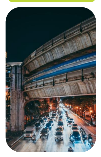
How might we move people and goods that minimise the use of fossil fuels and reduces greenhouse gas emissions?