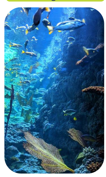
How might we protect and restore our natural resources, especially carbon sinks such as forests and wetlands?